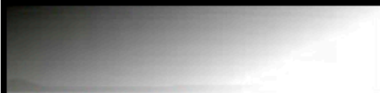
Ral 0000 Transparent