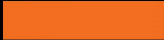
Ral 2004 Orange