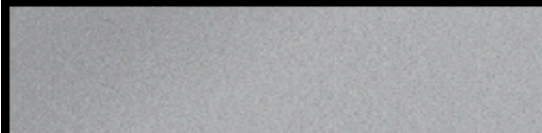
Ral 9006 Aluminium