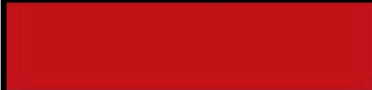
Ral 3000 Red